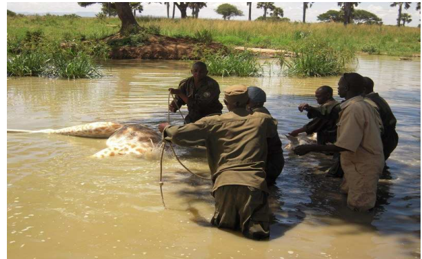
The UWEC team station ropes to lift the giraffe out of the pond.

The giraffe was released back to the wilderness to join other herds.